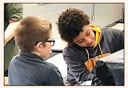
AC ARF plans to conduct monthly classes and workshops at Clinton Middle.

On Mar 5 we held our first class "Caring for Homeless Cats" for an after school program at Clinton Middle School, and talked about the needs of community cats. We helped them build outdoor shelters for homeless cats; the shelters will be distributed to low income seniors feeding homeless cats.